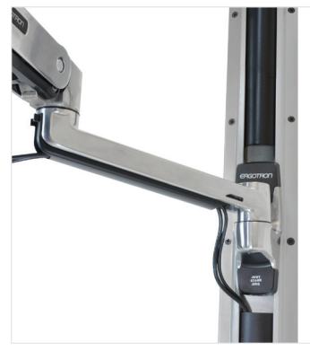
RECOMMENDED: ATTACH WALL MOUNT ARM TO AN ERGOTRON WALL TRACK USING BRACKET (97-091)