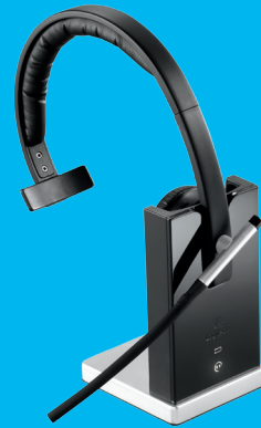
MONO (IN DOCK)