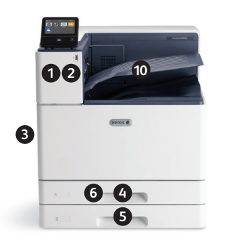
Xerox® VersaLink® C8000 and C9000 Default Configuration