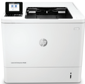
HP LaserJet Enterprise M608dn