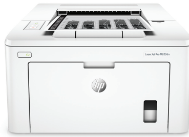
HP LaserJet Pro M203dn Printer

Get more pages, performance, and protection 1 from a wireless HP LaserJet Pro powered by JetIntelligence Toner cartridges. Set a faster pace for your business: print two-sided documents right away, and easily manage to help maximise efficiency.