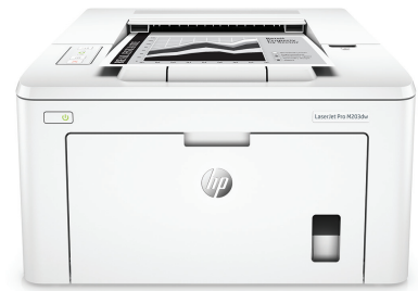
HP LaserJet Pro M203dw Printer