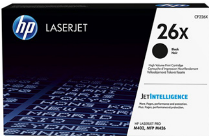
Original HP Toner cartridge with JetIntelligence

Bring out the best in your MFP. Print more consistent, high-quality pages than ever before, 2 using specially designed Original HP Toner cartridges with JetIntelligence. Count on better performance, higher energy efficiency, and the authentic HP quality you paid for—something the competition simply can't match. 2