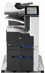
HP LaserJet Enterprise 700 color MFP M775z+