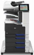
HP LaserJet Enterprise 700 color MFP M775z