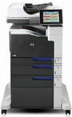
HP LaserJet Enterprise 700 color MFP M775f