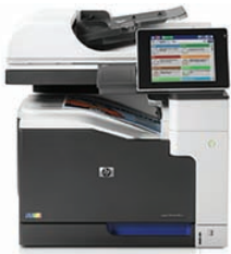
HP LaserJet Enterprise 700 color MFP M775dn